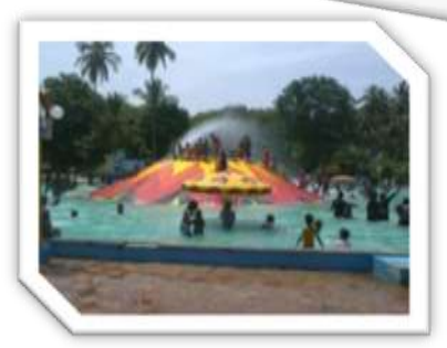
210, Balathandayutham st, Gandhi puram, K.A.S.Theatre road, Erode-638002, T.Nadu, INDIA